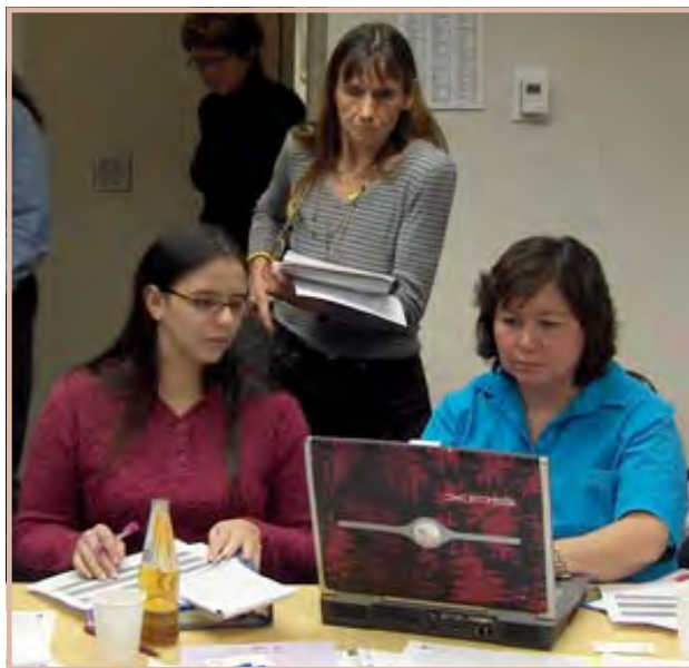
Participants planning a future community activity at a Cancer 101 training

Over the last eight years, we have benefited greatly from the wisdom, expertise, and vision of those who have partnered with us in the development, implementation, and evaluation of Cancer 101 . We are dedicated to continuing to work together with tribes in their efforts to reduce the burden of cancer. These activities include supporting those who wish to use Cancer 101 as an evidence-based education resource in seeking funding for community education. We will also share these results through publications and presentations with other tribal communities, scientists, and educators. These activities will move us closer to realizing our shared mission and vision of cancer-free tribal communities for generations to come.