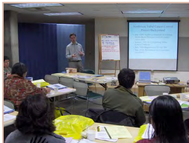
Cancer 101 Training February 2006

There were five trainings in Idaho, Oregon and Washington between February 2006 and June