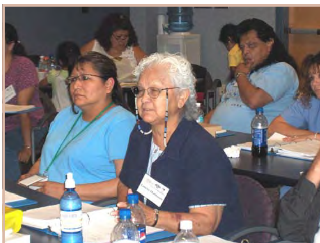
Cancer 101 Training May 2006